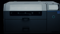
PRETREATmaker max 5